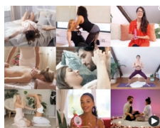
beducated Sex education platform with 150+ courses in adult sex education.