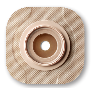
CeraPlus Convex Barrier

CeraPlus, our newest skin barrier, is designed to ensure your peristomal skin remains as healthy as possible. The Hollister CeraPlus skin barrier with Remois technology* is infused with ceramide, the skin's naturally occurring protection against dryness.