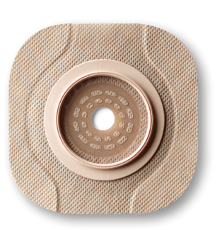
CeraPlus Flat Barrier