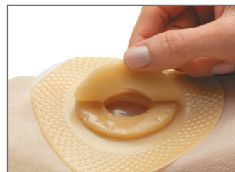
Figure 6 Stack for an improved fit