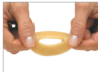
Figure 3 Stretch for an improved fit