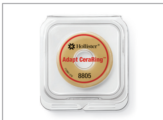
Figure 1 Remove from plastic tray