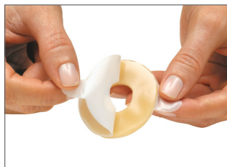
Figure 2 Remove both release liners