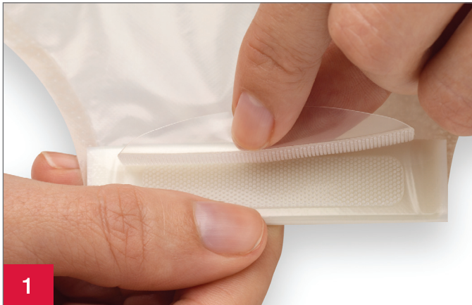
1 Opening Lift from the centre of the transparent flap

Before you apply your new pouch, close the pouch tail (see Figure 4 and Figure 5)