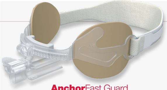
AnchorFast Guard Oral Endotracheal Tube Fastener